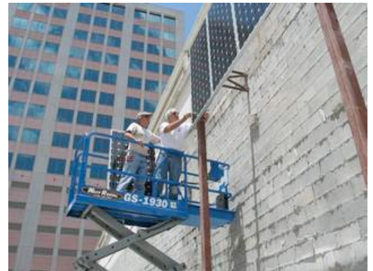
Buy this Photo

Hill's 25 kilowatt-hour system comes complete with an "island system" of batteries that always runs the store's cash registers, fans (to maximize cooling efficiency) and much of the store's lighting, she said. The system has the triple value of saving about $1,000 on the monthly utility bill, reducing her business's peak demand (a continuing savings) and providing a series of federal, state and local tax advantages.